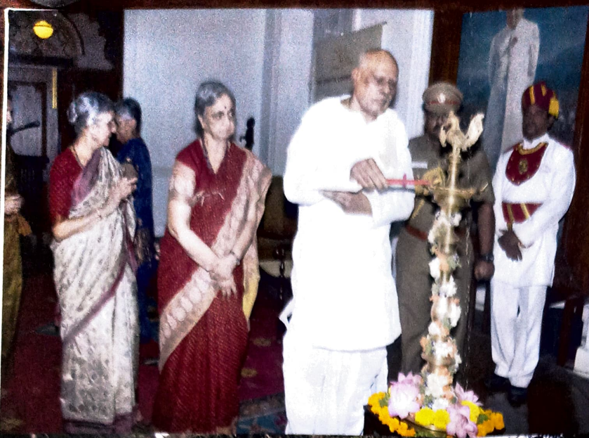
Lighting of Lamp at Kamala Awards