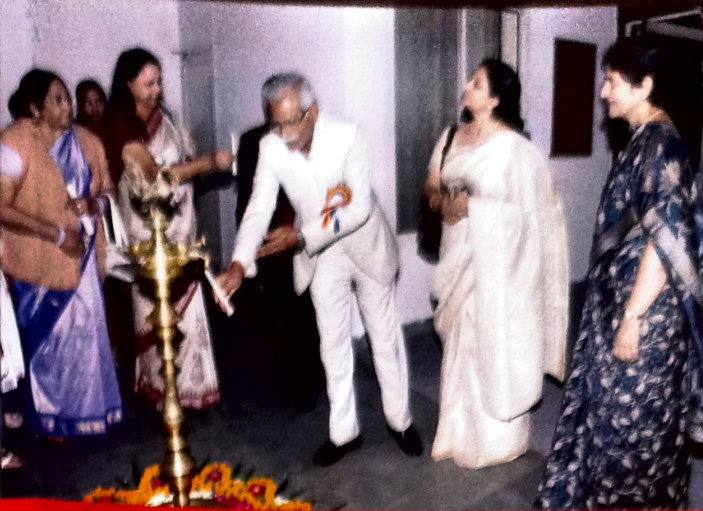
Lighting of Lamp at Lucknow