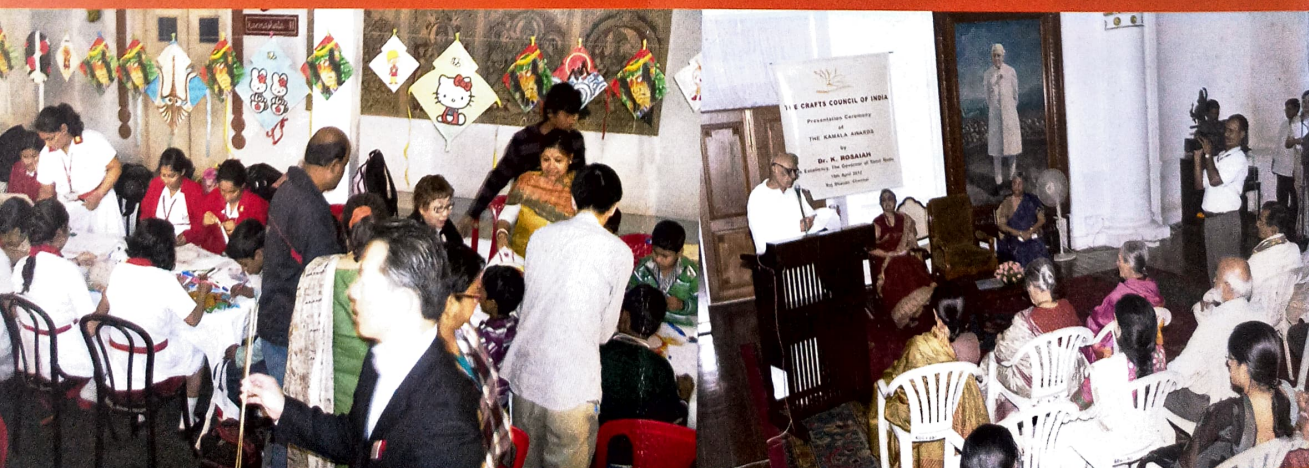
Students at the Kite making workshop