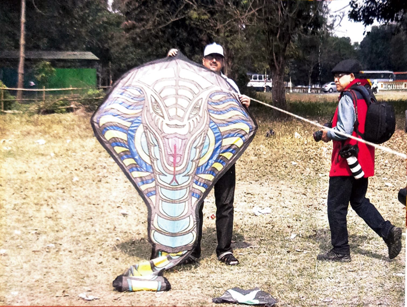
An attractive Snake Kite